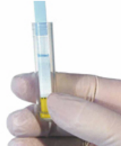
Test strip inserted