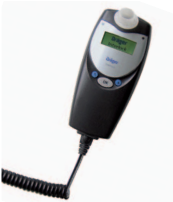
Dräger Interlock XT: A safe start

The Dräger Interlock XT is a breath-alcohol measuring instrument with a vehicle immobilizer. After taking a breath alcohol measurement, it prohibits a driver who has consumed alcohol from starting the motor. It can easily be installed into the vehicle. By installing a Dräger Interlock XT, you can avoid accidents caused by alcohol consumption. Additionally, long-term changes in the drinking attitude may be an added benefit.