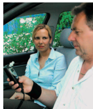
Dräger Interlock XT: Fits in the dashboard.