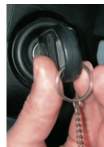
4. Accepted breath sample: motor starter is enabled